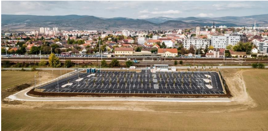
Car park at the railway station near Bratislava