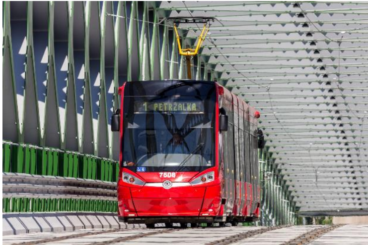
Starý most in Bratislava