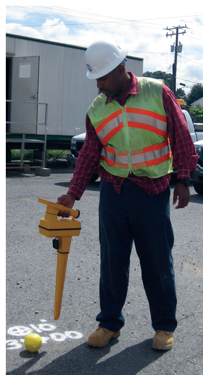
A portable, hand-held device is used to program and later find electronic markers by transmitting a utility-specific radio frequency signal into the ground.

"Our VDOT team conducted a GPS/RFID pilot program to confirm the viability of this marking technology for roadway construction — a process that included programming and placing markers for each utility category," McLaughlin said. "We were able to confirm that a buried marker leads the locating technician directly to an exact spot and dependably distinguishes between side-by-side utilities without subjective interpretation."